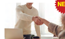
English for Professionals (30+)